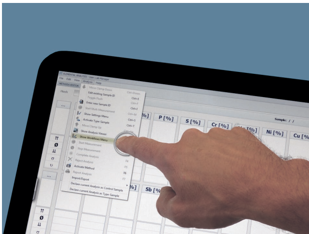
ELEMENTAL.SUITE software provides full touchscreen capabilities.

The result is a CCD-based instrument, which lets you achieve your goals faster, more reliably, and more cost-effectively than ever before.