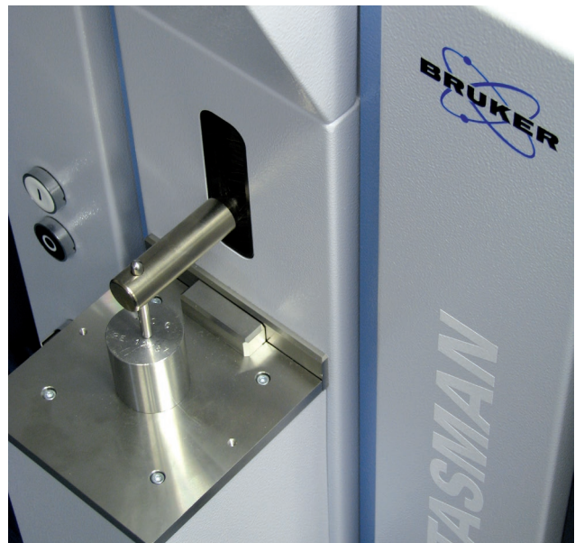
Co-axial argon flow: reduced consumption and minimized maintenance.