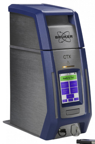
CTX™ Portable XRF analyzer Mg (12) to U (92)

Bruker's portable Counter Top XRF, the CTX™, is for qualitative and semi-quantitative elemental analysis. It also performs quantitative analysis when utilizing calibrations with like-sample standard reference materials. Results can be given as spectra, composition, or Pass/Fail/Inconclusive for single or multi-elemental analysis of elements from Mg to U. The convenient form factor of the CTX is ideal for samples presented in containers such as powders, soils and liquids; small samples; and those which require extended measurements of more than a few seconds.