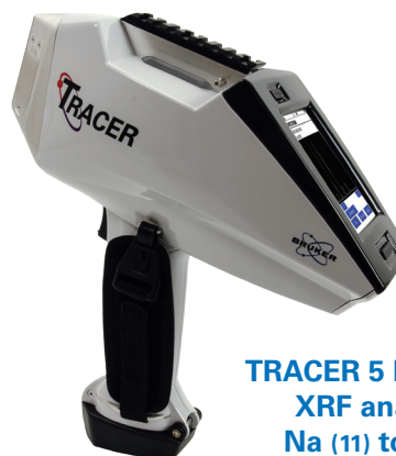
TRACER 5 Handheld XRF analyzer Na (11) to U (92)