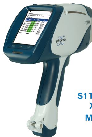
S1 TITAN Handheld XRF analyzer Mg (12) to U (92)

Bruker's two handheld XRF spectrometers, the TRACER 5™ and the S1 TITAN™, are for qualitative and semi-quantitative elemental analysis. They also perform quantitative analysis when utilizing calibrations with like-sample standard reference materials. Results can be given as spectra, composition, or Pass/Fail/Inconclusive for single or multi-elemental analysis of elements from Na to U. A desk or bench top stand with a PC can be used for samples presented in containers such as powders, soils and liquids; small samples; and those which require extended measurements of more than a few seconds.