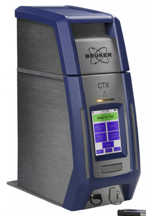
CTX™ Portable XRF analyzer Mg (12) to U (92)