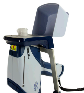
S1 TITAN Handheld XRF analyzer Mg (12) to U (92)