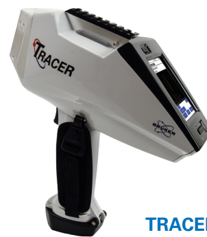
TRACER 5 Handheld XRF analyzer Na (11) to U (92)