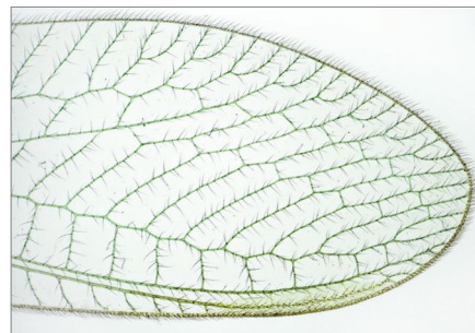
Green lacewing Transmitted light brightfield