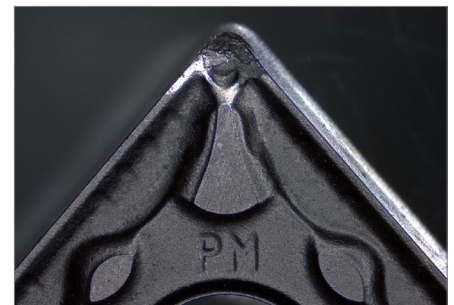
Indexable insert, shows tool wear. Reflected light, ringlight, zoom 0.8x