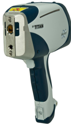
Bruker's S1 TITAN 800 and 600 Handheld XRF models can be equipped for mercury analysis