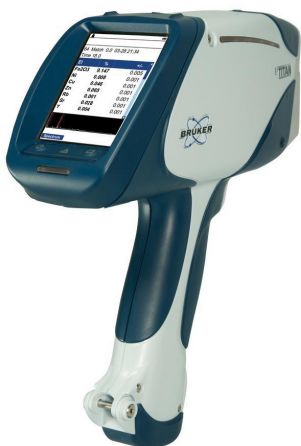
Bruker's S1 TITAN 800 or 600 XRF is ideal for fast and straightforward Hg contamination screening in a preventative maintenance program.

This accumulation not only poses maintenance concerns for corrosion, catalyst poisoning and liquid metal embrittlement (LME); but, unchecked Hg may harm workers and the environment by escaping into the atmosphere, ground and marine ecosystems. A worker's health and safety is especially vulnerable through volatile sources, surface contamination and particulate contamination during hot work such as welding and cutting. A direct impact to decommissioning workers who dismantle, remove and dispose of systems is of particular concern.