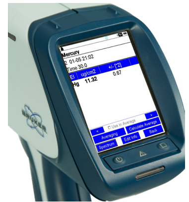
Intuitive touchscreen user interface for operation and results

Although Hg can start at low ppb/ppm levels in feedstock, it can develop into much higher concentrations over time during processing, transport and storage. Costs associated with decontamination of equipment can be significant. Consequently, it is important to screen for mercury contamination as part of a regularly scheduled preventative maintenance program. Bruker's handheld S1 TITAN 800 or 600 XRF offers a quick and cost effective way to determine Hg levels in equipment.